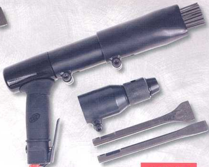
170PG-KIT 180PG-KIT (see below)