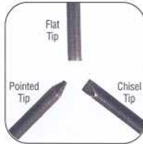
Multiple needle tips available for all your applications