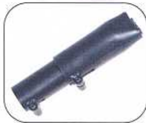
Easily adjustable bayonet oval front tube