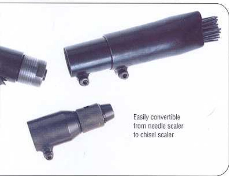
Easily convertible from needle scaler to chisel scaler.